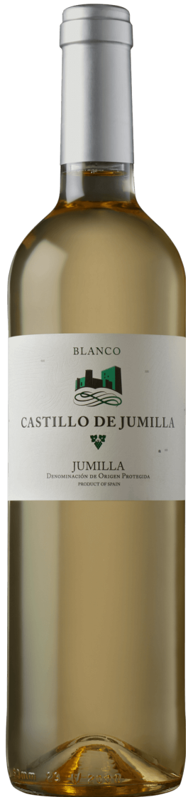
Spain - White