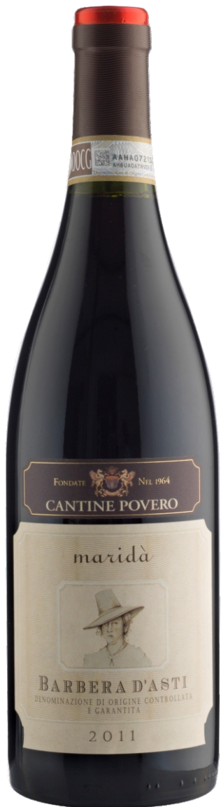
Italy - Red