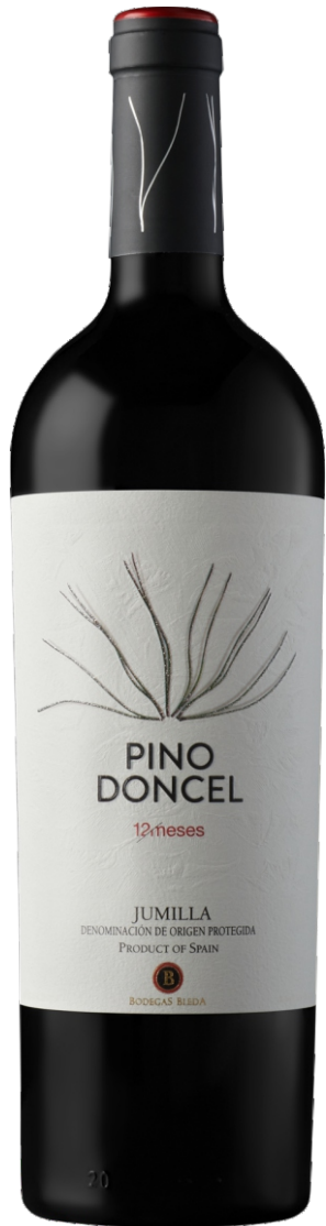
Spain - Red