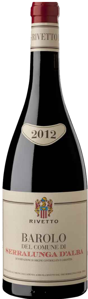
Italy - Red