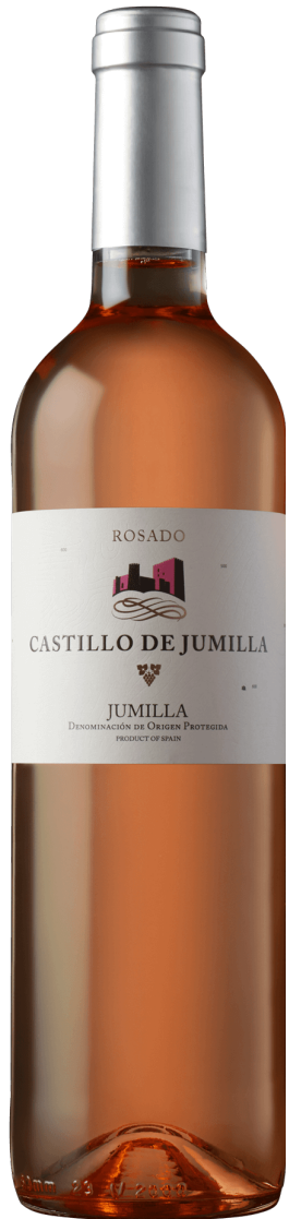
Spain - Rose