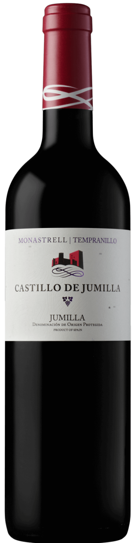
Spain - Red